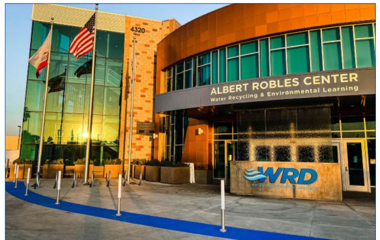
Figure 1: Albert Robles Center

Process design features focused on achieving the smallest footprint and lowest capital and operation costs, particularly energy. As a result, a direct coupling of UF to a first and second stage primary RO feeding and a third stage secondary RO for concentrate recovery is in place. The direct coupling, the method of feeding the UF filtrate directly to the RO, eliminates the need for a break tank and associated equipment to store the UF filtrate/RO feedwater. Historically, this type of arrangement reduces the risk of biological growth within the break tank, thus reducing the RO system's contamination risk in seawater desalination systems. However, as wastewater sources may contain high levels of organics, this design was essential in energy savings from the reduced footprint.