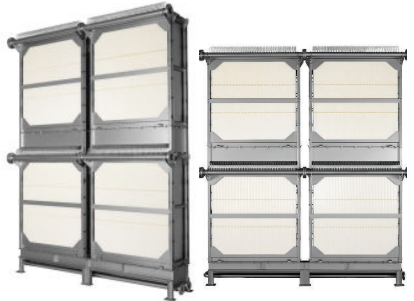
Figure 4: TMR140-400DW MBR module by Toray featuring four element blocks in a double-deck arrangement