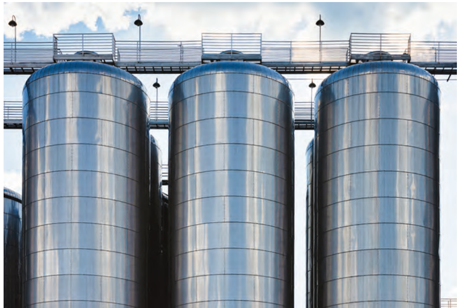
Figure 1: Fermentation tanks

Lagunitas integrated reuse into the wastewater treatment design using Toray's membrane bioreactor (MBR) and reverse osmosis (RO) membrane technologies. Toray's flat-sheet MBR module removes 99% of contaminants sending the filtrate to RO