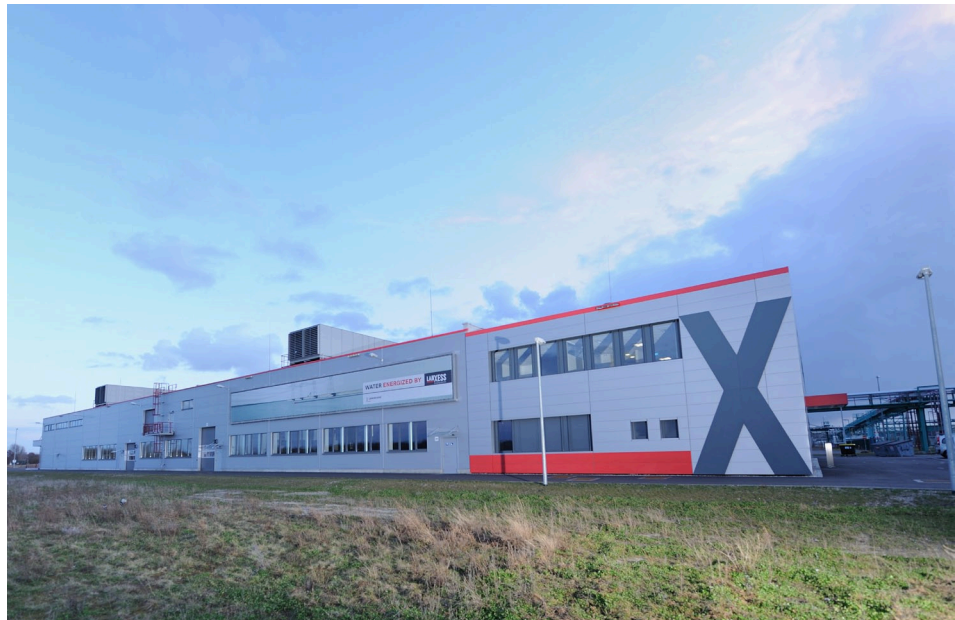
LANXESS has begun production of Lewabran® reverse osmosis membrane and elements at a new production site in Bitterfeld, Germany.

When designing an RO plant, the software offers the possibility to get a recommended array based on the information that has been entered. Further updates are planned this year, for example the option for post-treatment with IX, and a detailed cost and energy calculation for the RO design.