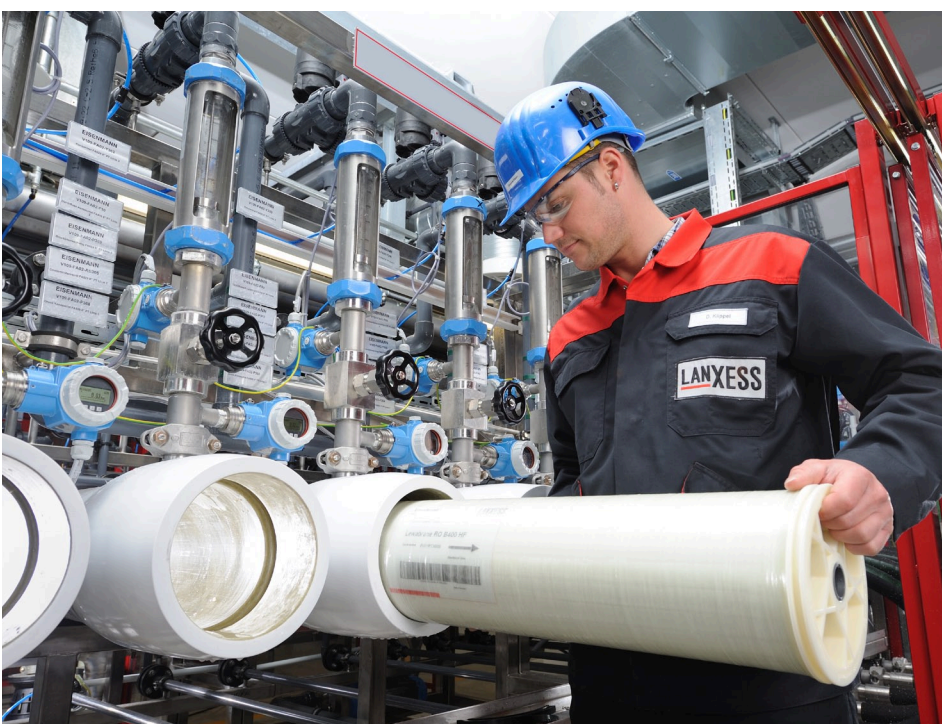
Lewabrane® reverse osmosis membrane elements from LANXESS being installed.

Due to its chemistry, the surface of a polyamide membrane is usually negatively charged, and often results in cationic fouling that is extremely difficult to remove. A typical example of cationic fouling is fouling with iron. Iron chloride ( \text{FeCl}_3 ) is a very common flocculation chemical used in pre-treatment systems. If the dosing is too high, even just for a short period, the cationic fouling can irreversibly foul the RO membrane surface. Apart from a well adjusted iron chloride dosing system, a lower negative surface charge is the best option to reduce the fouling potential of this event.