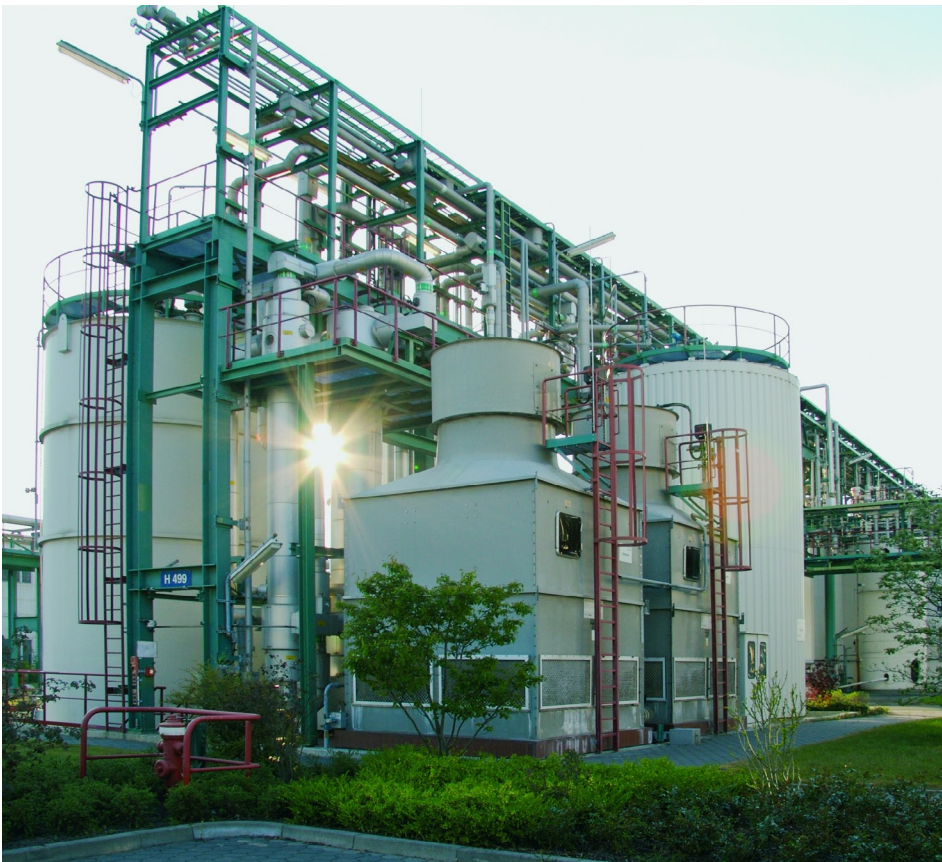
The ion exchange resin manufacturing plant at Bitterfeld, Germany.